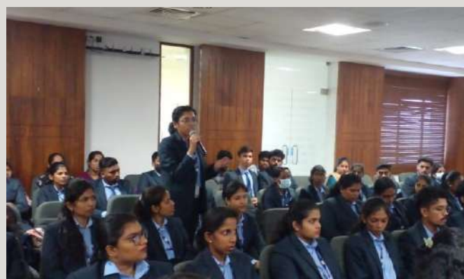
KICMA students interacting during the panel discussion at RCC as a part of World No Tobacco Day