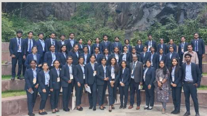
Director, Faculty members and students at STUNA

Students from the Kerala Institute of Co-operative Management (KICMA), NeyyarDam, actively participated in STUNA, a prestigious event organized by the National Institute of Personnel Management (NIPM) Trivandrum Chapter on July 5-6, 2024. The two-day event brought together renowned experts from the management and corporate sectors, facilitating enriching interactions and knowledge sharing. A series of panel discussions were held, covering diverse topics relevant to the field of management. The STUNA program aimed to foster meaningful discussions, facilitate knowledge sharing, and networking.