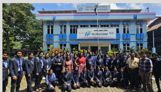
KICMA students and faculty at HLL Lifecare limited, Peroorkada