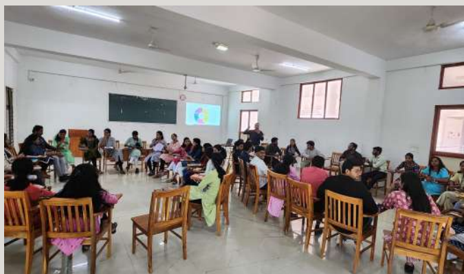
Work Readiness Workshop