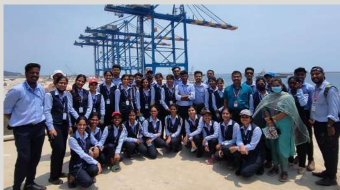
KICMA students at Vizhinjam Sea Port