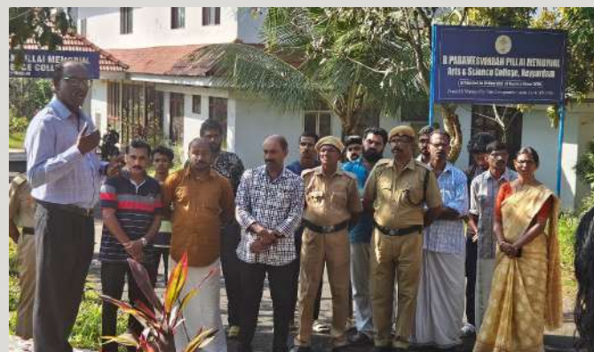
Republic day flag hosting ceremony at KICMA