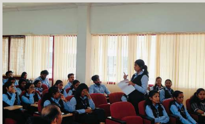
Union Budget Analysis at KICMA