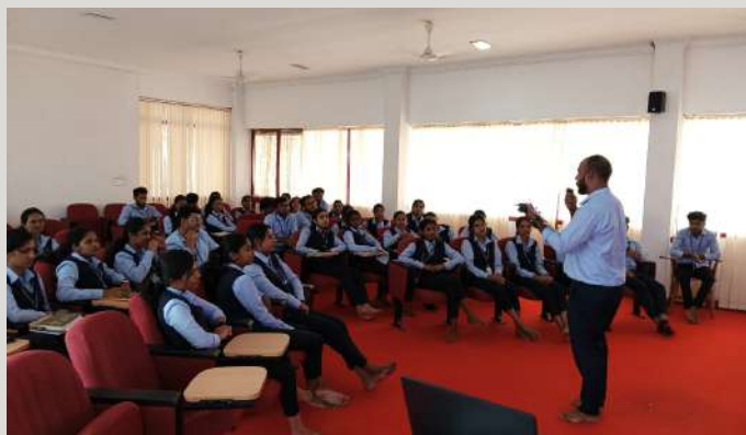
National Reading day celebration at KICMA