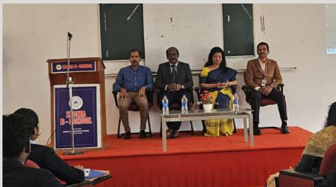
Placement drive by Testhouse