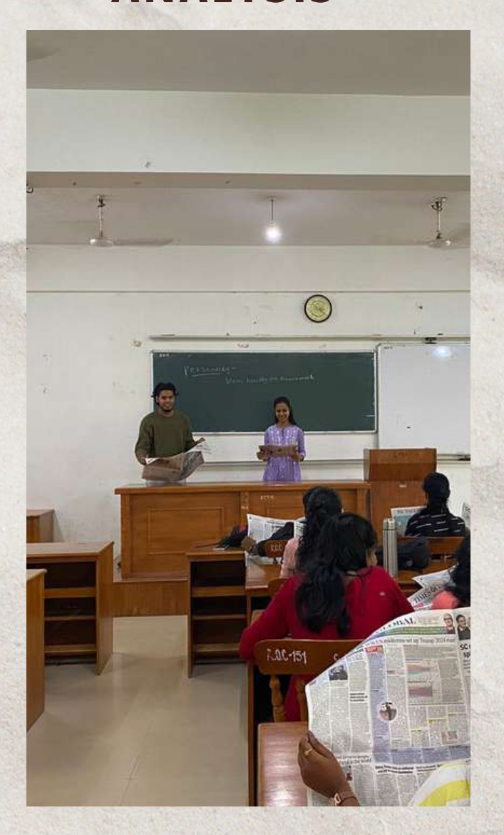
KICMA MBA Students initiated News Analysis programme on daily basis. They analyses the news from Times Of India Daily and present it in the class followed by a discussion.