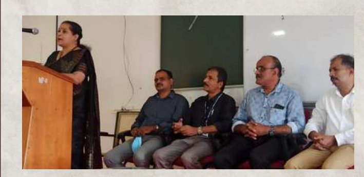
KICMA B SCHOOL conducted training program for co-operative employees on September 27th 2022.