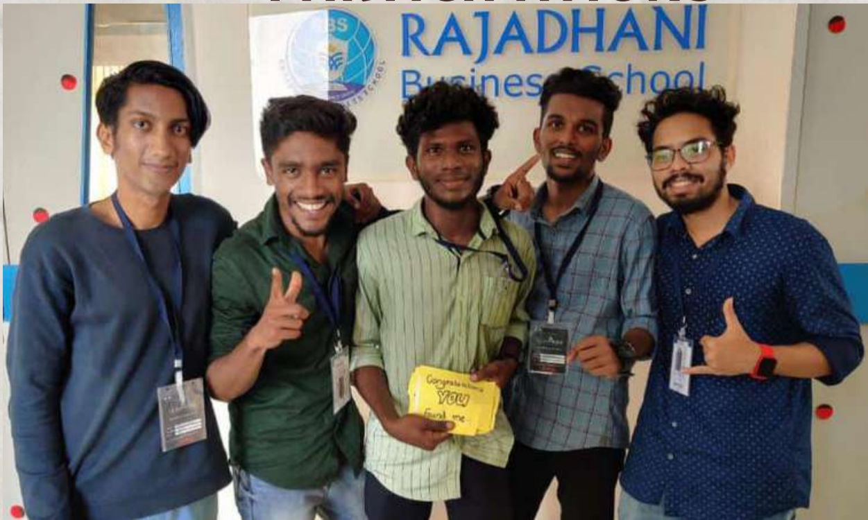
At Le emperoz , management fest conducted by Rajadhani business school.